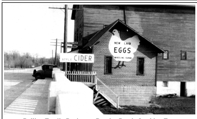
Balling Family Business - Dundee Road - Looking East

"The object of this Society shall be the discovery, preservation, and dissemination of knowledge about the Community of Wheeling."