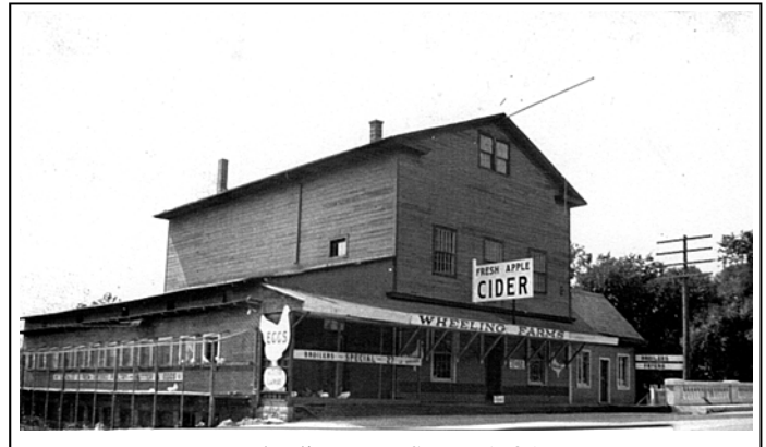
Wheeling Farm Store - 1935

The property eventually was taken over by the Forest Preserve District of Cook County, Illinois. 🛩