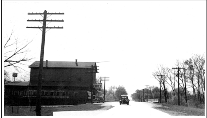
Dundee Road - Looking West